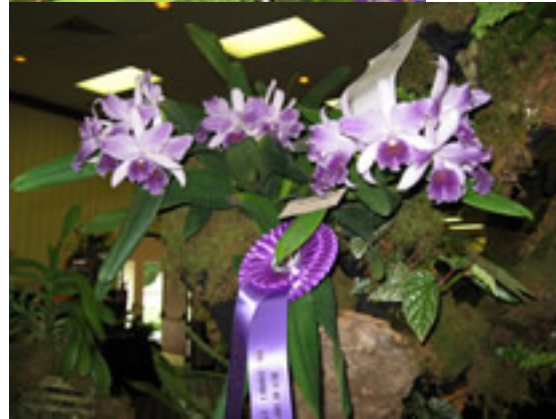
The Betty Forker Award